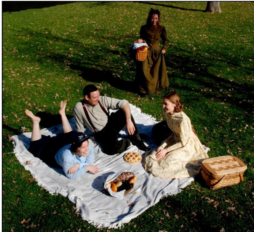
Little Women at the Commonwealth runs from November 20 through December 21, 2010