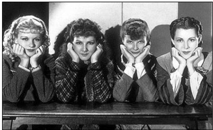
From the 1933 film with Katharine Hepburn as Jo

And that's precisely what an adaptation tries to do - transcend the structure of the original in order to capture the magic and wonder that lies beyond. This is also, perhaps, a dynamic at work in many people's lives at this time of year. For some, it might be working to transcend the commercialism of the holiday season to embrace its true purpose, or perhaps seeking the sense of celebration that is supposed to be the reason for the traditions that can suddenly seem burdensome. Or, perhaps, like the March family in this incarnation of the story, it's about trying to get past a sense of grief and loss when everyone else is so joyful and carefree.