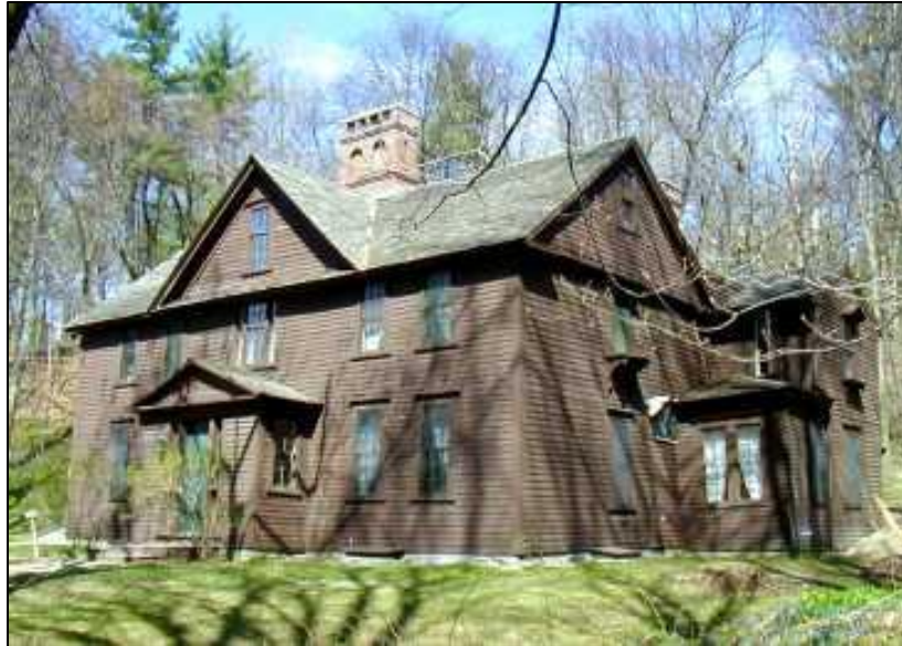
The Alcotts lived in his house in Historic Concord, Massachusetts, where Louisa May Alcott wrote Little Women .

The March family, in this stage version and in the novel, certainly are not without their own challenges and obstacles to happiness. Ms. Alcott purposefully worked against common romantic traditions to make Meg, Jo, Beth, and Amy more real to her readers, and the resounding popularity of her work is a testament to her success. These characters resonate all that much more because we see where they have been bruised and banged up, but if the story of Little Women can be said to offer inspiration, then perhaps it comes to us as this: the path to happiness lies in friends, and family, and opening our hearts to all the love that is around us even if (and especially if) we don't even realize it's there.