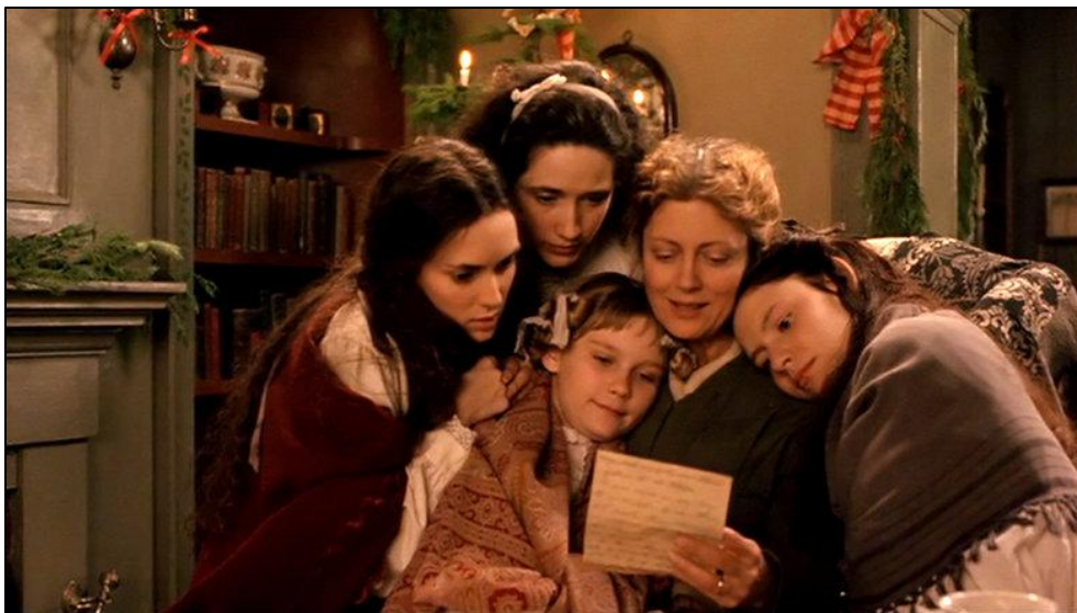
From the 1994 film with Susan Sarandon as Marmee March